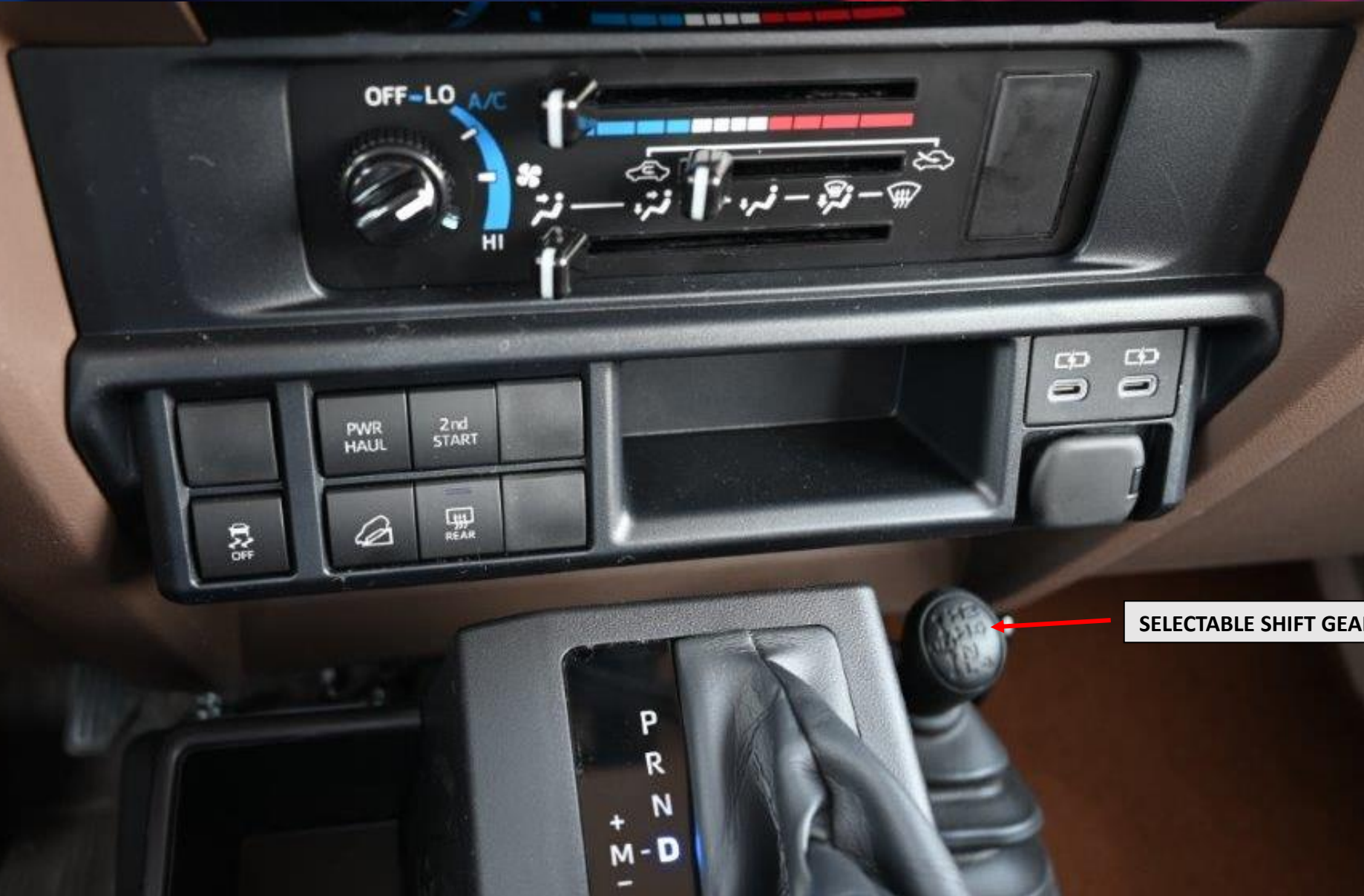
SELECTABLE SHIFT GEAR