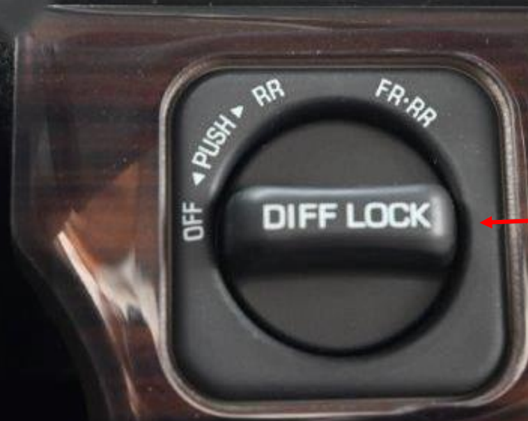
REAR & FRONT DIFFERENTIAL LOCK